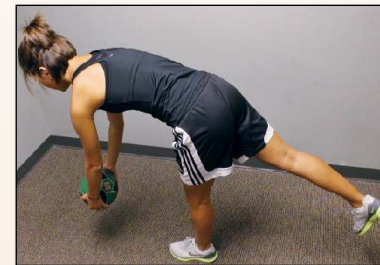
Standing single leg deadlifts