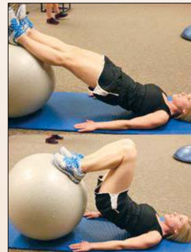
Physioball bridges with hamstring curls