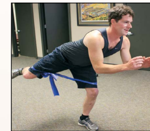
Standing fire hydrant

for the body. All these muscles are prone to injury if not strengthened. Below are a group of exercises that we recommend to our clients to help decrease their risk of injury, improve speed, and endurance. In general, we recommend doing these exercises 3 to 4 times per week at 2-3 sets of 15 repetitions.